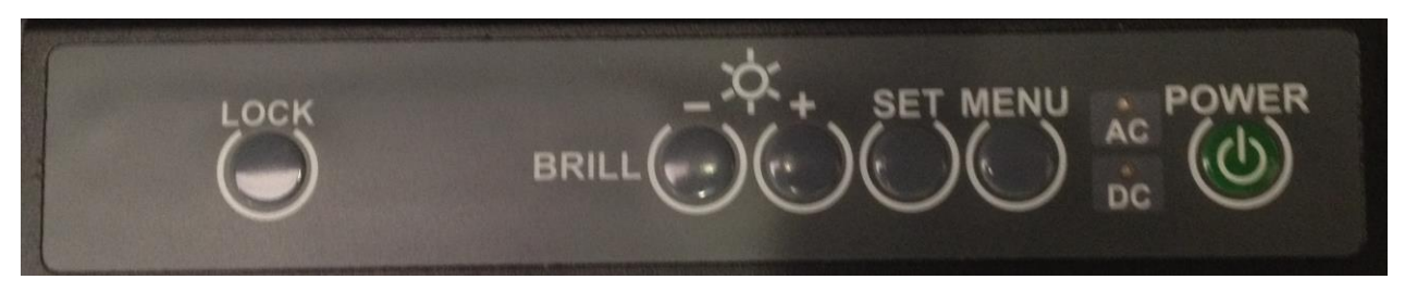
Figure 2. Front Panel with controls and indicators.